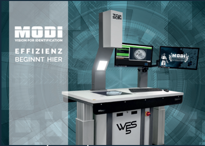
WES V5 - Incoming Good System